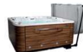
Ideal accessory for taking off the spa cover without any effort at all.