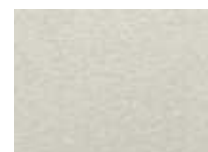
72 Pearl Cameo