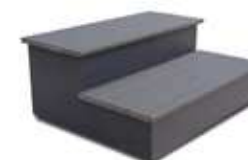
Woodermax GRAPHITE step (or BASIC model)